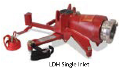
LDH Single Inlet