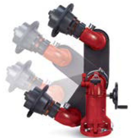
Hi-Riser Liftoff Shown with direct mount flange