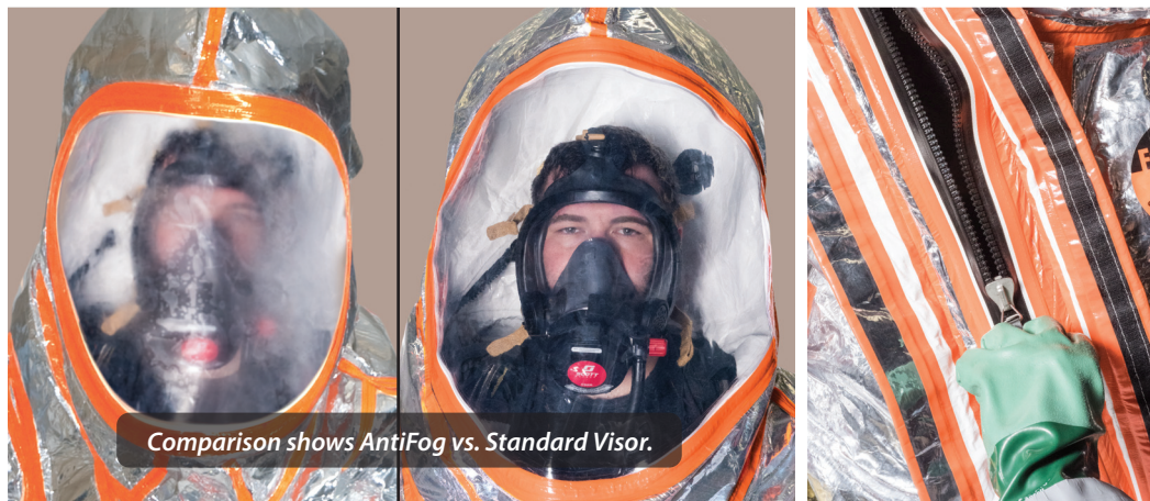
Comparison shows AntiFog vs. Standard Visor.